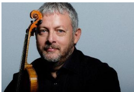
Photo 3: Fabio Biondi, Hong Kong Philharmonic Orchestra