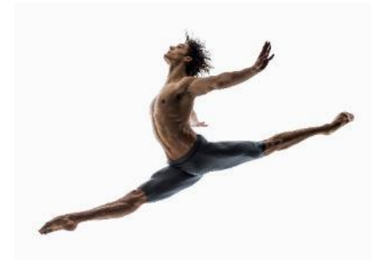
Photo 10: Guest Principal Artist Daniel Camargo