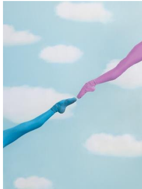
Photo 2: Dancers (from left): Ashleigh Bennett, Yang Ruiqi | Creative: Design Army