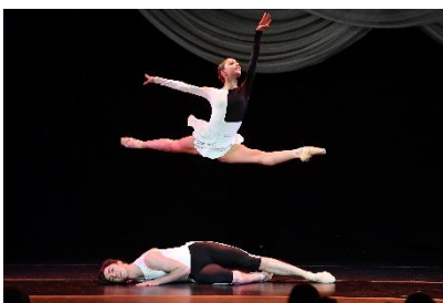
Photo 28: turn(it)out festival: HKB Presents American Ballet Theatre Studio Company promotional image | Escapades by Amy Hall Garner | Photography: Vince Bucci | Courtesy of ABT Studio Company