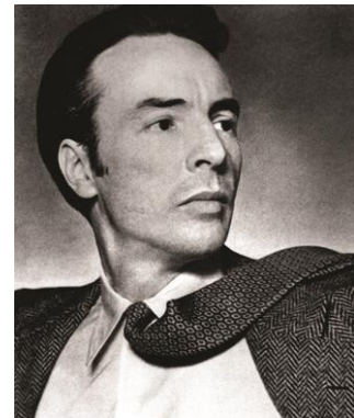
Photo 36: George Balanchine, Choreographer