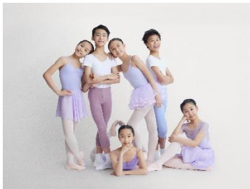
Photo 34: HKBALLET | WORKSHOPS promotional image | Children Dancers | Creative: Design Army