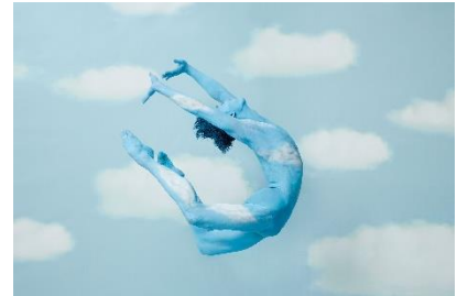
Photo 3: Dancer: Wang Zi | Creative: Design Army