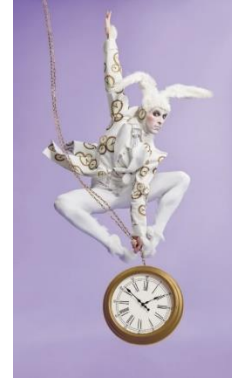
Photo 12: ALICE (in wonderland) promotional image | Dancer: Jonathan Spigner | Creative: Design Army