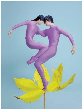
Photo 7: Dancers (from left): Gao Ge, Ethan Chudnow | Creative: Design Army