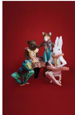
Photo 23: The Nutcracker promotional image | Children Dancers | Creative: Design Army