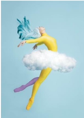
Photo 1: Dancer: Ye Feifei | Creative: Design Army

Download all images via here or click on the thumbnails to download